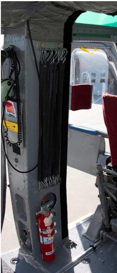
Figure 1 LHS Velcro, Detail (Item 2) Shown

The method shown in the following instructions should be considered optimal, but variation to accommodate existing aircraft configurations are permissible.