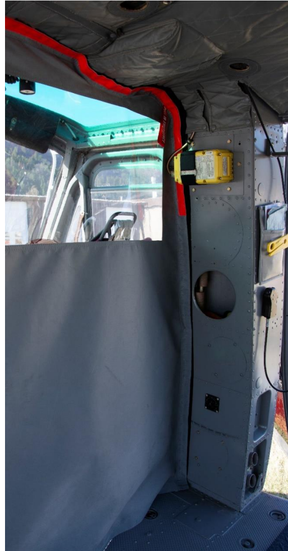
Figure 6 RHS Crew Barrier, Assy (Item 1) Shown